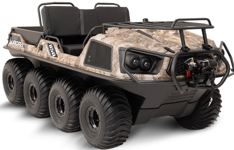
TRUETIMBER® PRAIRIE CAMO